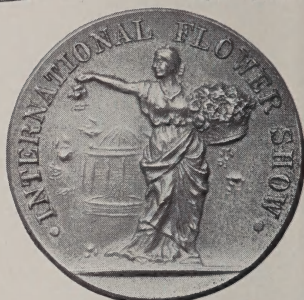
For Collection New Darwin Tulips March 16-21, 1931